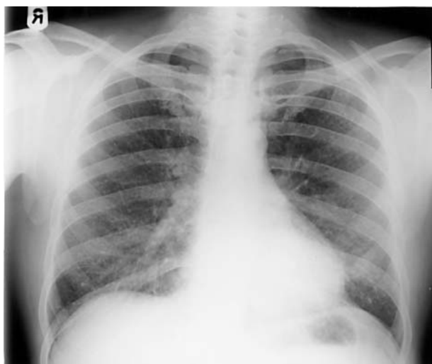
Figure 1 Postero-anterior chest radiograph of case 2, showing fine reticular shadowing and small opacities consistent with siderosis.

To date this patient has had over 150 venesections from 1985 onwards, but has never been anaemic; his ferritin is now 450 \mu\text{g/l} . He continues in the same occupation as a