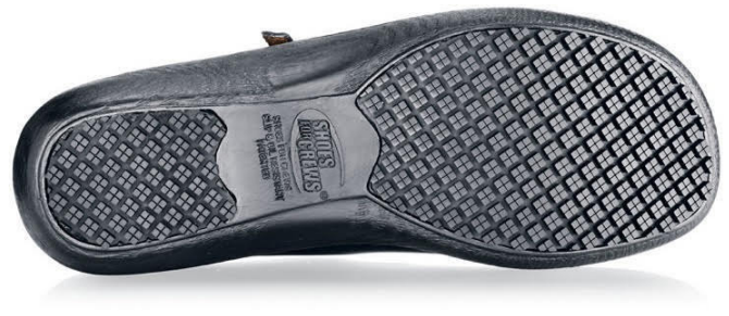
Figure 1 Example of sole of intervention footwear.

Participants were inducted into the trial with a welcome text message followed by a pre-randomisation 'run-in' period of data collection in the form of weekly text messages, for up to 6 weeks, requesting data on slips at work in the previous week. The purpose of the 'run-in' period was twofold: to provide a baseline slip rate; and to assess for engagement with the text message data collection process. By only randomising participants who provided slip data for at least 2 weeks, we hoped to maximise response to the post-randomisation outcome texts. Participants were randomised 1:1 to either be offered and provided with a pair of 5* GRIP-rated slip-resistant shoes or asked to wear their usual work shoes. Randomisation was through the University of York,