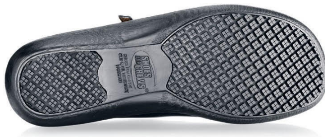
Figure 1 Example of sole of intervention footwear.

Participants were inducted into the trial with a welcome text message followed by a pre-randomisation 'run-in' period of data collection in the form of weekly text messages, for up to 6 weeks, requesting data on slips at work in the previous week. The purpose of the 'run-in' period was twofold: to provide a baseline slip rate; and to assess for engagement with the text message data collection process. By only randomising participants who provided slip data for at least 2 weeks, we hoped to maximise response to the post-randomisation outcome texts. Participants were randomised 1:1 to either be offered and provided with a pair of 5* GRIP-rated slip-resistant shoes or asked to wear their usual work shoes. Randomisation was through the University of York,