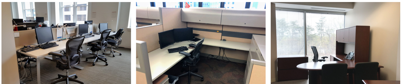
Figure 1 Examples of office workstation types from the study. From left to right, open bench seating, cubicle and private office.

Cardiac activity was recorded using a small, chest-worn sensor, EcgMove 3 (movisens). Details of the characteristics of this device have been published elsewhere. 21 To quantify the physiological stress response, we calculated the mean of the standard deviation of normalized interbeat intervals (SDNN). 22 SDNN is a global index of HRV and reflects longer term circulation differences. Lower SDNN values indicate an increase in the sympathetic stress response, and higher SDNN values have consistently been found to indicate better health. 23 SDNN index, the mean of each 5 min period of SDNN, was calculated according to the guidelines of the European Society of Cardiology and the North American Society of Pacing and Electrophysiology. 22 In order to better capture stressful moments, we then calculated the 10th percentile of the SDNN index variable. 24 The 10th percentile value represents relatively low HRV values during