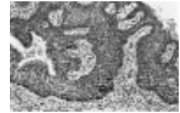
See p 395