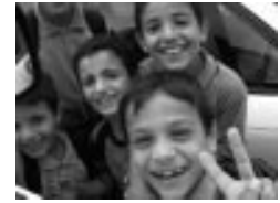
See p 376