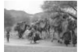
See p 493

Find out what's in the latest issue the moment it's published