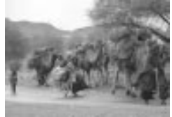
See p 493

Find out what's in the latest issue the moment it's published