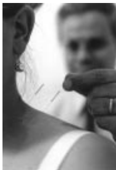
See p 141

NEW ONLINE SUBMISSION GO TO WEBSITE TO SUBMIT YOUR MANUSCRIPT