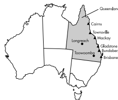
See p 739