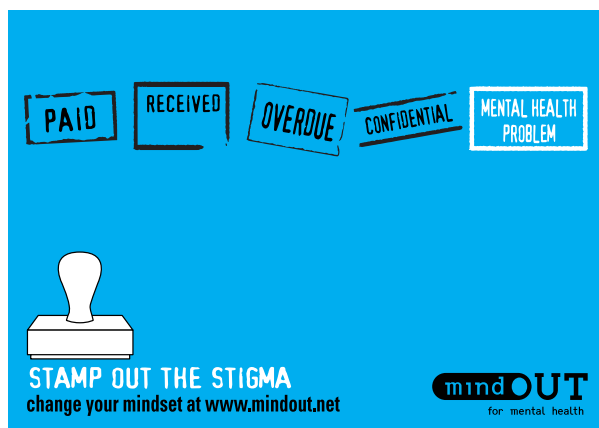
Figure 3 Poster for the UK MindOut campaign, sponsored by the Department of Health.