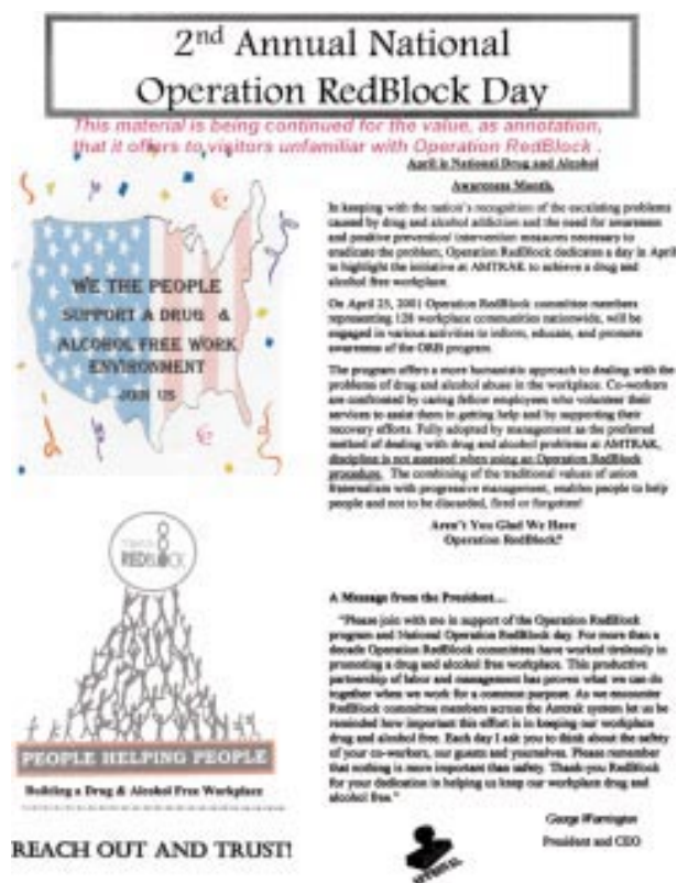
Figure 2 Poster proclaiming the RedBlock programme devised by the Amtrak corporation in the USA to foster an alcohol-free work environment.

One of the primary reasons behind the (often covert) discrimination of those with mental ill health is concern about health and safety. The public generally view those with mental illness as unpredictable and potentially dangerous. 32 While those with current psychoses may have a slightly elevated risk of violent behaviour compared to the general public, particularly if associated with substance abuse, this is less than that posed by young men and substance abusers in general. 33 Those with anxiety, depression, and common mental disorder have no greater risk of violent behaviour. More subtle issues such as conduct at work, which is explicitly dealt with in the ADA, and cooperating with co-workers, are more likely to be affected by an individual's personality than their illness,