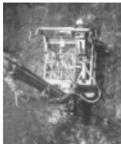
See p 9