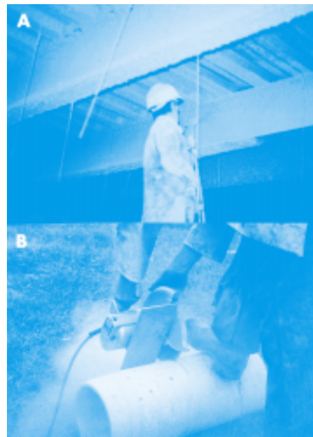
Figure 1 Uncontrolled asbestos exposure. (A) Spraying asbestos fireproofing insulation. (B) Cutting transit pipe containing chrysotile and crocidolite asbestos.

The evidence that the hazard of asbestos exposure is better assessed by measuring asbestos fibre of certain size by microscopy than by the older method of measuring dust concentration led to the institution of standards and a prevention strategy based on measurement of fibres thinner than 3 µm in diameter and longer than 5 µm in length. 12 The evidence that some asbestos diseases such as mesothelioma are not dose related led to concern about asbestos contamination from sprayed material and other sources in buildings and schools. This has led to a flurry of remedial activity for this non-occupational hazard. Billions of dollars have been spent in removing asbestos from public and other buildings, despite the fact that the evidence is not equivocal that such non-occupational asbestos exposure constitutes a serious risk. However, the prevention strategies that have been instituted