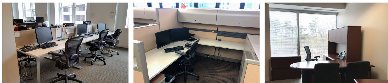
Figure 1 Examples of office workstation types from the study. From left to right, open bench seating, cubicle and private office.

Cardiac activity was recorded using a small, chest-worn sensor, EcgMove 3 (movisens). Details of the characteristics of this device have been published elsewhere. 21 To quantify the physiological stress response, we calculated the mean of the standard deviation of normalized interbeat intervals (SDNN). 22 SDNN is a global index of HRV and reflects longer term circulation differences. Lower SDNN values indicate an increase in the sympathetic stress response, and higher SDNN values have consistently been found to indicate better health. 23 SDNN index, the mean of each 5 min period of SDNN, was calculated according to the guidelines of the European Society of Cardiology and the North American Society of Pacing and Electrophysiology. 22 In order to better capture stressful moments, we then calculated the 10th percentile of the SDNN index variable. 24 The 10th percentile value represents relatively low HRV values during