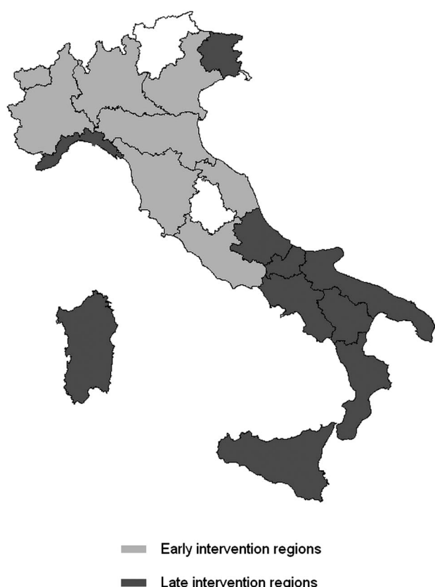
Figure 1 Italy: early and late intervention regions.

This analysis focused on serious injury rates because the literature suggests that this measure is less correlated to macroeconomic factors than minor injury rates 16 and is less affected by under-reporting. 17