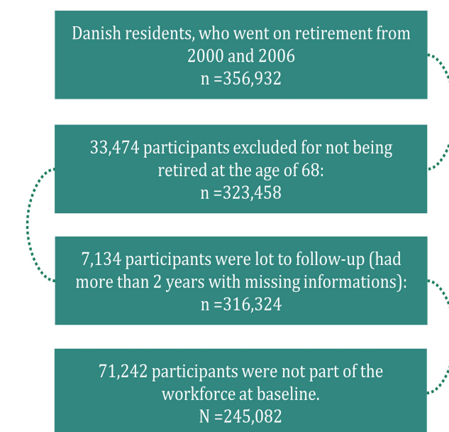
Figure 1 Flowchart of the study population.

During the follow-up period (2000–2006), three main types of retirement were available in Denmark: (A) old-age pension, available for all workers at the age of 67 and above. From 1 July 2004, workers born after 1 July 1939 could retire on old-age pension at the age of 65; (B) postemployment wage programme (PEW), available for qualifying workers from the age of