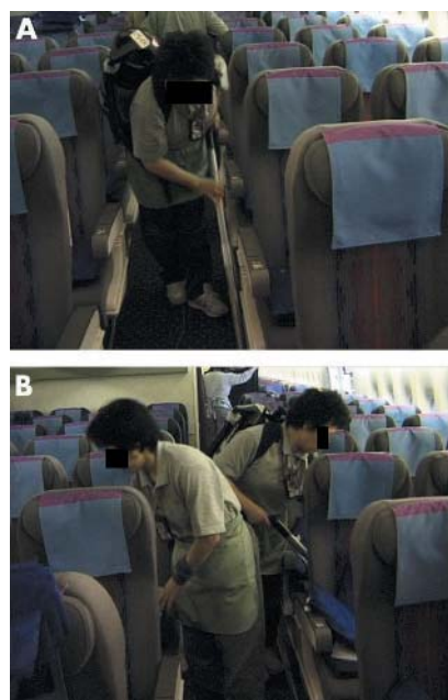
Figure 1 Vacuum floor cleaning.

front/footrest cleaning and vacuuming task, the situation becomes more difficult as the workers have to lift up the footrest and stretch the hose or the sweeper into the seat front to clean the floor. Indeed, postural analysis revealed that working with the back in a forward flexed position constituted up to 81% of all the back postures. Figure 2 shows typical work postures of this task.