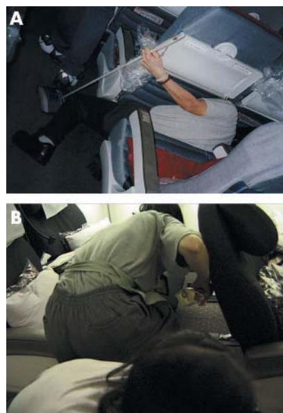
Figure 2 Seat front cleaning.

Galley cleaning involves tidying up and cleaning of the workbench of the galley, food cart, storage cupboards, and coffee