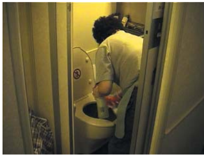
Figure 4 Toilet cleaning.

postures include: administrative measures, provision of ergonomic aids, and training and education of the workers.