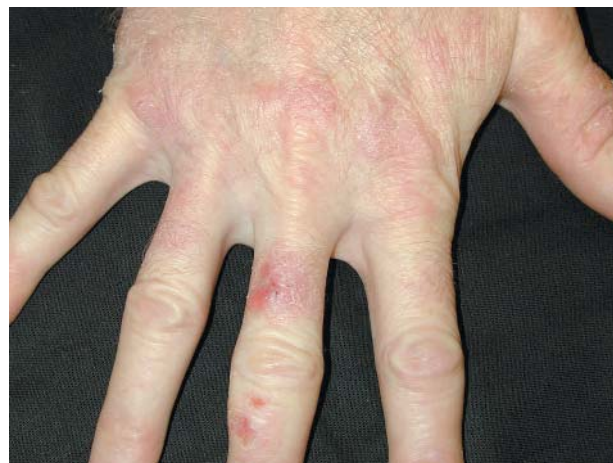
Figure 2 Irritant contact dermatitis affecting predominantly the dorsal aspects of the hand and fingers.

The mainstay of diagnosis in allergic contact dermatitis is the patch test. This test has a sensitivity and specificity of 70–80%. 11 It is not used directly to diagnose ICD or urticaria and involves the reproduction under the patch tests of allergic contact dermatitis in an individual sensitised to a particular antigen(s). The standard method involves the application of antigen to the skin at standardised concentrations in an appropriate vehicle and under occlusion. The back is most commonly used principally for convenience because of the area available, although the limbs, in particular the outer upper arms, are also used. A number of application systems are available, of which the most commonly used are Finn chambers. With this system, the investigator adds the