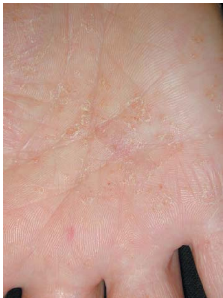
Figure 3 Vesicular palmar eczema due to allergic contact dermatitis from dandelions.

individual allergens to test discs that are loaded onto adhesive tape. The International Contact Dermatitis Research Group has laid down the standardisation of gradings, methods, and nomenclature for patch testing. 12 The diagnosis of ICD is made by noting the exposure pattern to irritants and with negative patch tests to potential allergens.